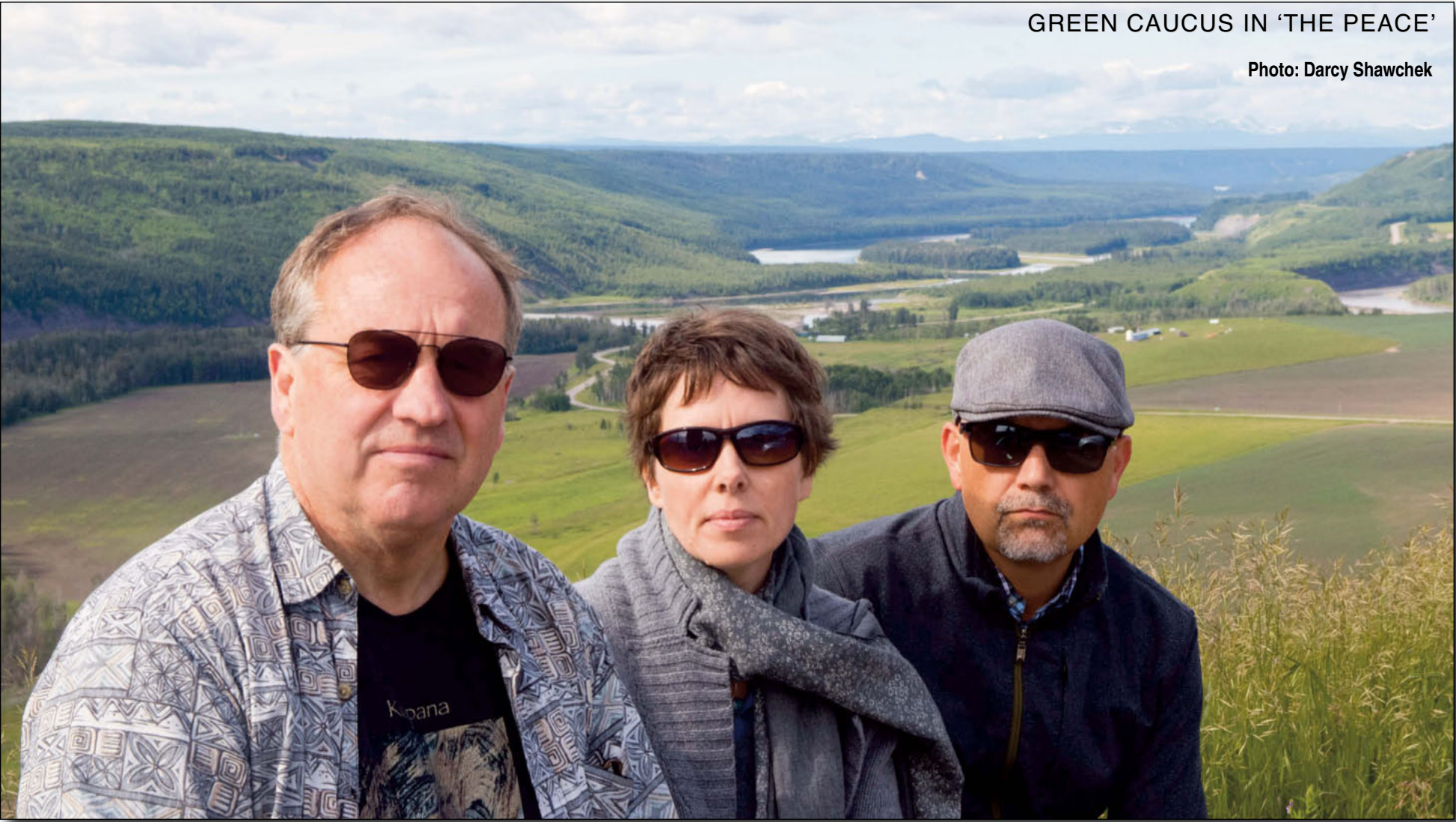
GREEN CAUCUS IN ‘THE PEACE’