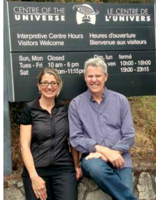
Advocating for reopening of the Centre of the Universe Observatory with Saanich South MLA Lana Popham