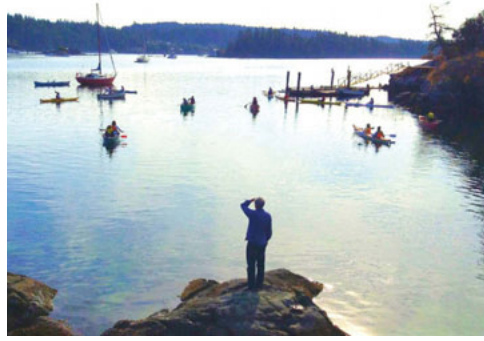
Witnessing protectors of Grace Islet burial site.