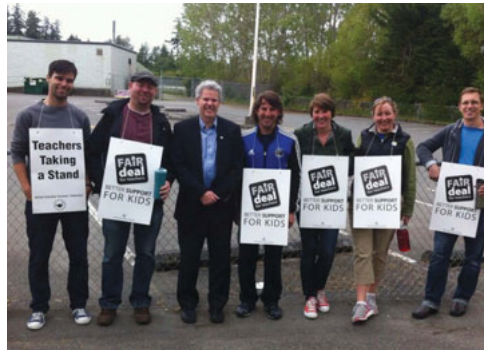
Standing with teachers at Parkland Secondary.