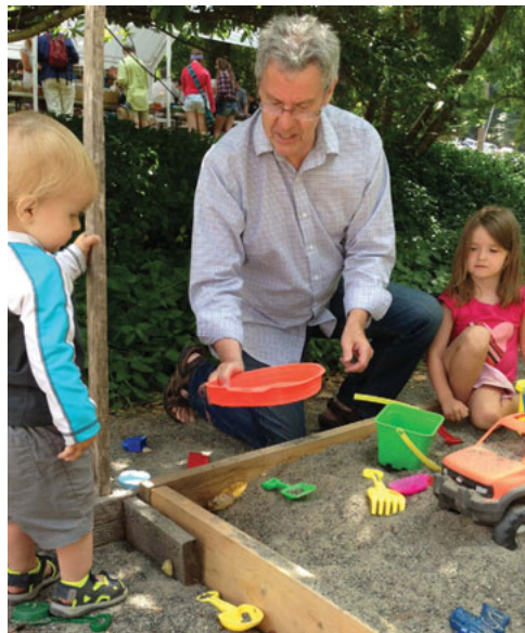
Sandbox town hall at Mayne Island's St. Mary Magdalene Church Fair.